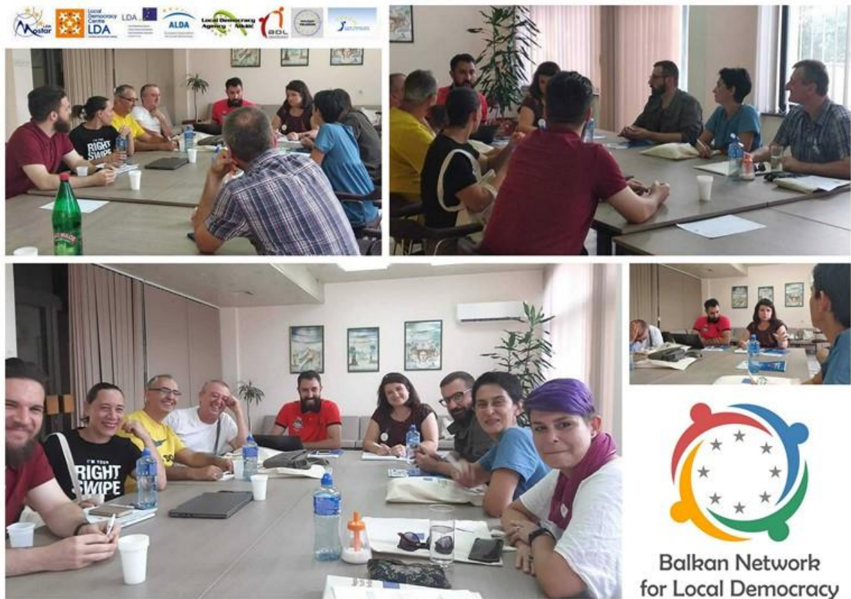
BNLD Governing Board meeting, Knjaževac

LDA CSS gives active contribution to the work of the Fundraising Group of BNLD. During the fourth quarter of 2019, 6 project proposals were created and submitted for potential funding to different international donors. “WB Cultural heritage in 24 hours” was the first official project granted to BNLD by the Tandem Western Balkans programme.