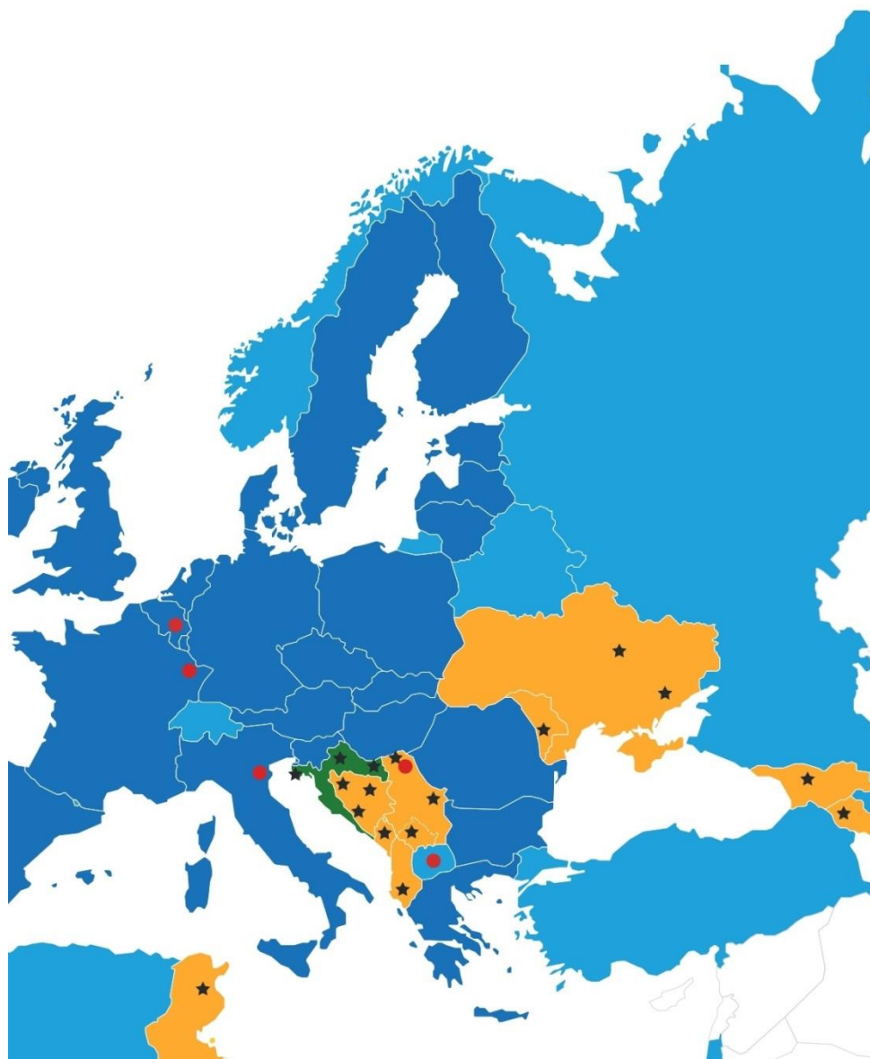
The network of LDAs and ALDA

All LDAs function as self-sustaining, locally registered NGOs, but they are different from other local NGOs because of the international framework they operate in. Indeed, the LDAs develop partnerships with local authorities and NGOs from all over Europe giving to the whole network direct access to an international framework through the support of ALDA, the Council of Europe and the European Union.