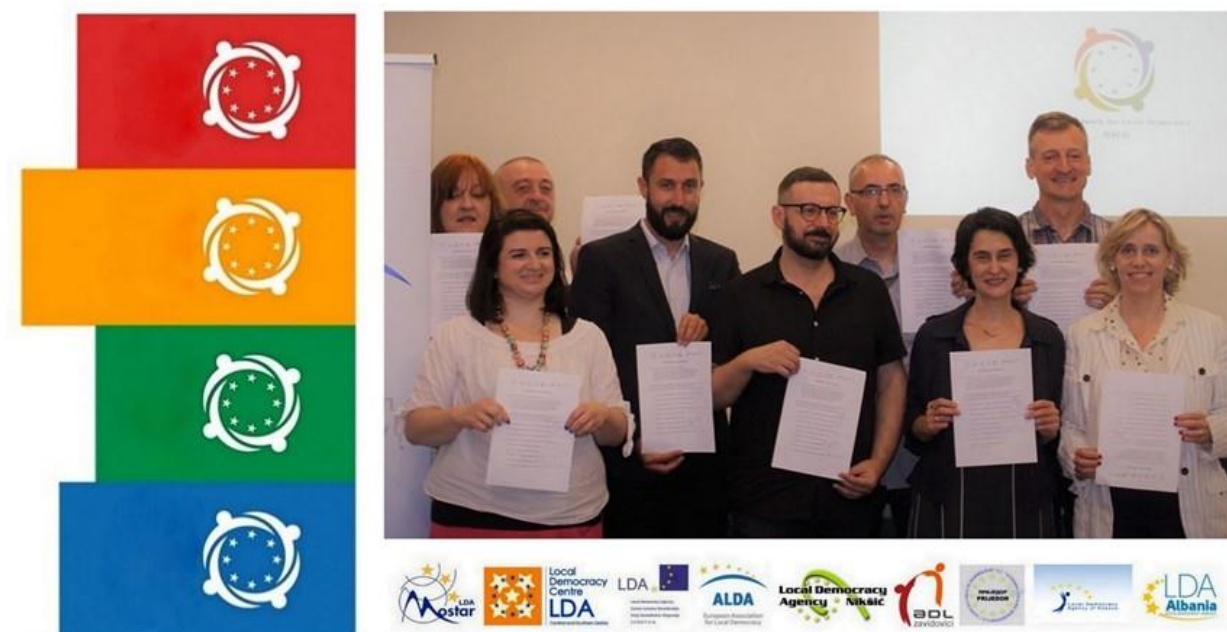
The constituent assembly of BNLD, Skopje

Balkan Network for Local Democracy BNLD is founded by the European Association for local democracy (ALDA) and the 7 Local Democracy Agencies (LDA) from Western Balkans aiming to support regional cooperation. The network has been actively operating from 2015 and has been formally registered in Skopje, North Macedonia during 2019.